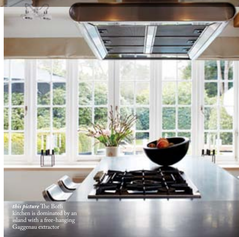
this picture The Boffi kitchen is dominated by an island with a free-hanging Gaggenau extractor