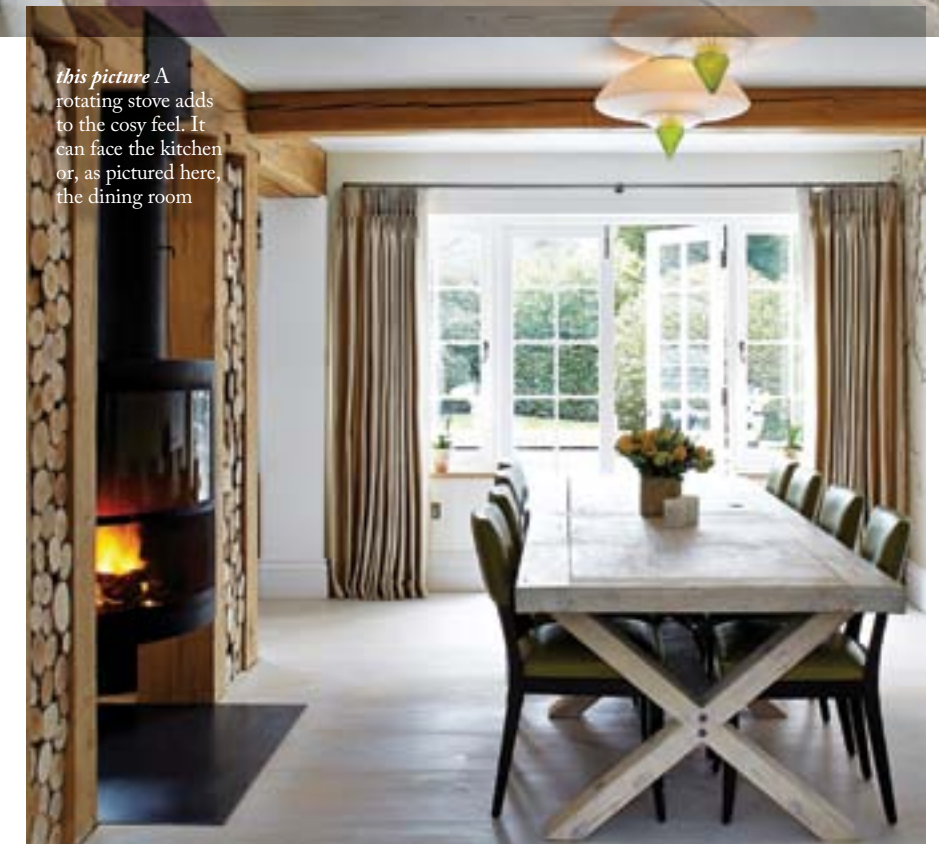
this picture A rotating stove adds to the cosy feel. It can face the kitchen or, as pictured here, the dining room