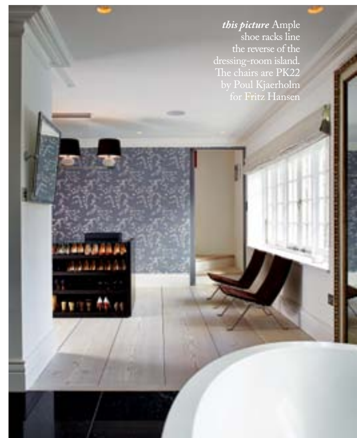
this picture Ample shoe racks line the reverse of the dressing-room island. The chairs are PK22 by Poul Kjaerholm for Fritz Hansen