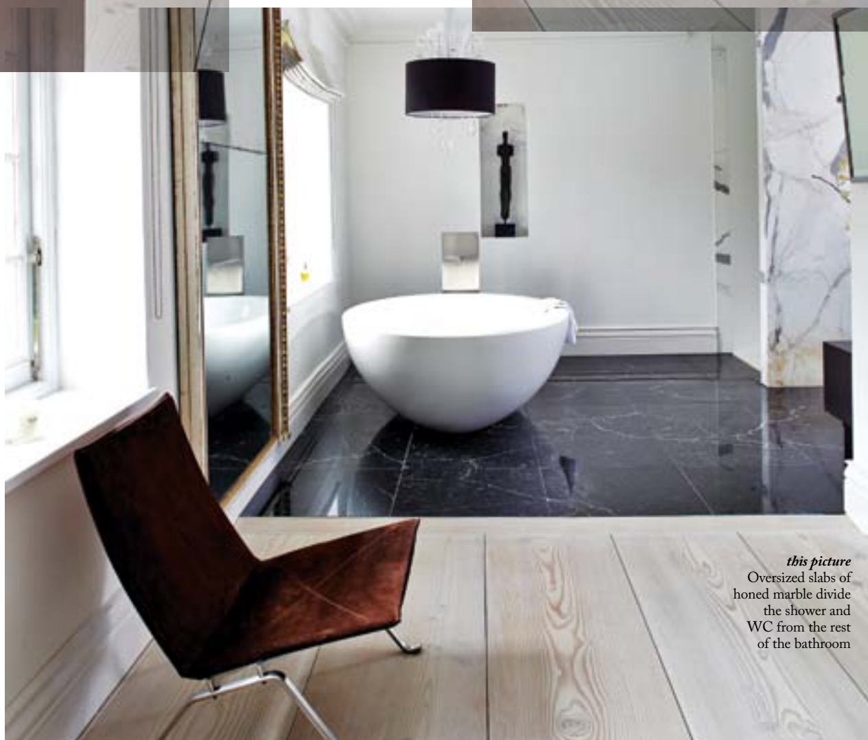
this picture Oversized slabs of honed marble divide the shower and WC from the rest of the bathroom

'When we started this project, I felt that we'd compromised, and that the house would dictate what we could and couldn't do. As it has evolved, however, we've been able to create a family home that truly reflects our style and the way we live.' GD