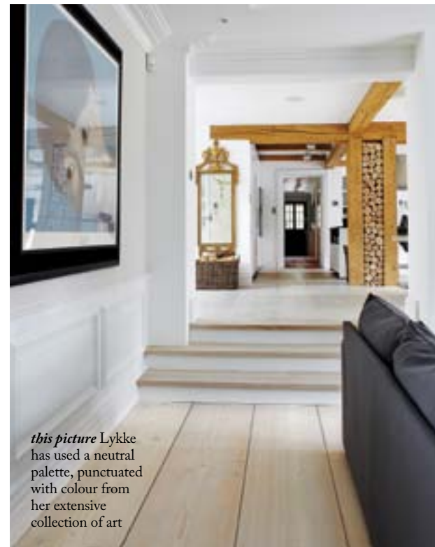
this picture Lykke has used a neutral palette, punctuated with colour from her extensive collection of art